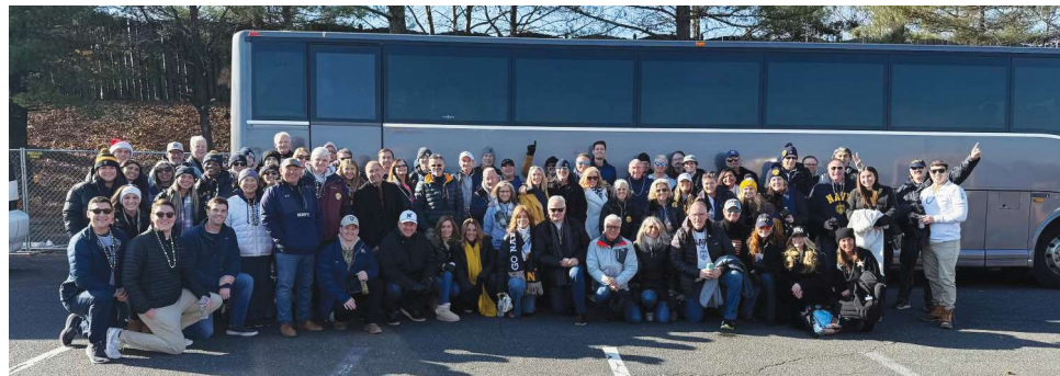
'88: Looks like '88ers, family, and friends are having a great time at the 125th Army-Navy Football Game!

✉ "Many of you knew my mother, particularly those on the 150's Football Team and track teams. She was at virtually every game cheering loudly, above the rest of the crowd it seemed, for each of my four years by the Bay."