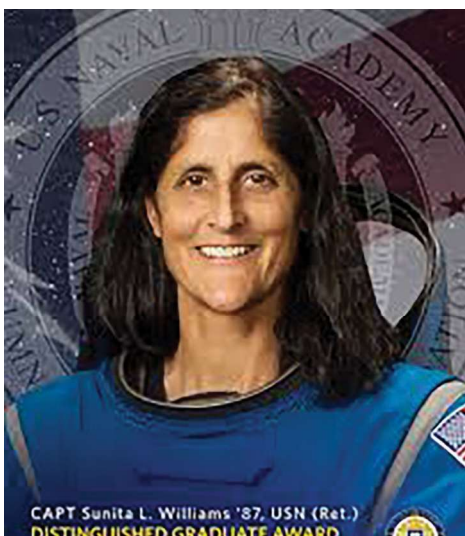
Suni Williams named USNA Distinguished Graduate

Let us take a moment to celebrate Suni Williams and her incredible career as an astronaut! From her time at the Naval Academy to her recent selection as a USNA Distinguished Graduate , Suni has truly made us proud. Her achievements, including multiple spacewalks and her current mission commanding the ISS, are nothing short of inspiring. Recently, Suni hosted a live Zoom call from the International Space Station, connecting with members of the USNA Class of 1987. As you can see, she managed to smuggle some Navy swag up to the ISS before the Army-Navy game! She gave us a little tour of the ISS and wowed us with the amazing exercise equipment she has used to stay gravity-ready for her return. It was an unforgettable experience, giving us all a glimpse into life in space and a chance to ask questions directly to Suni. It is alumni like Suni who remind us of the heights we can reach and the impact we can have on the world. Congratulations, Suni!