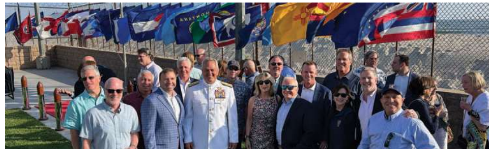
Class of 1986 en masse celebrating Collin's retirement