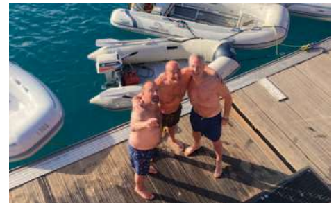
Class of 1987 in the British Virgin Islands