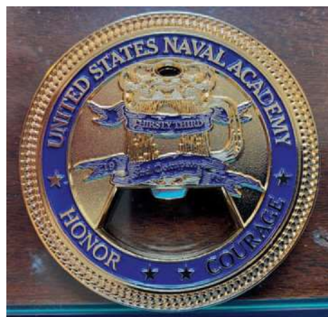
Class of 1987 Plebe Year Thirsty Third Challenge Coin - Back