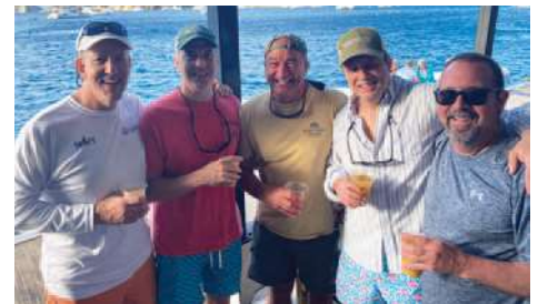
Class of 1987 in the British Virgin Islands