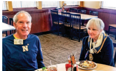
March luncheon attendees