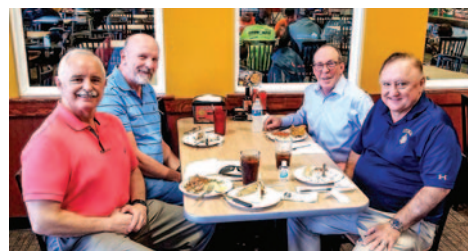
March luncheon attendees